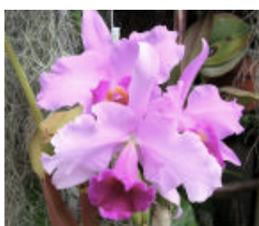
A glimpse of the Blooms & Butterflies exhibit.