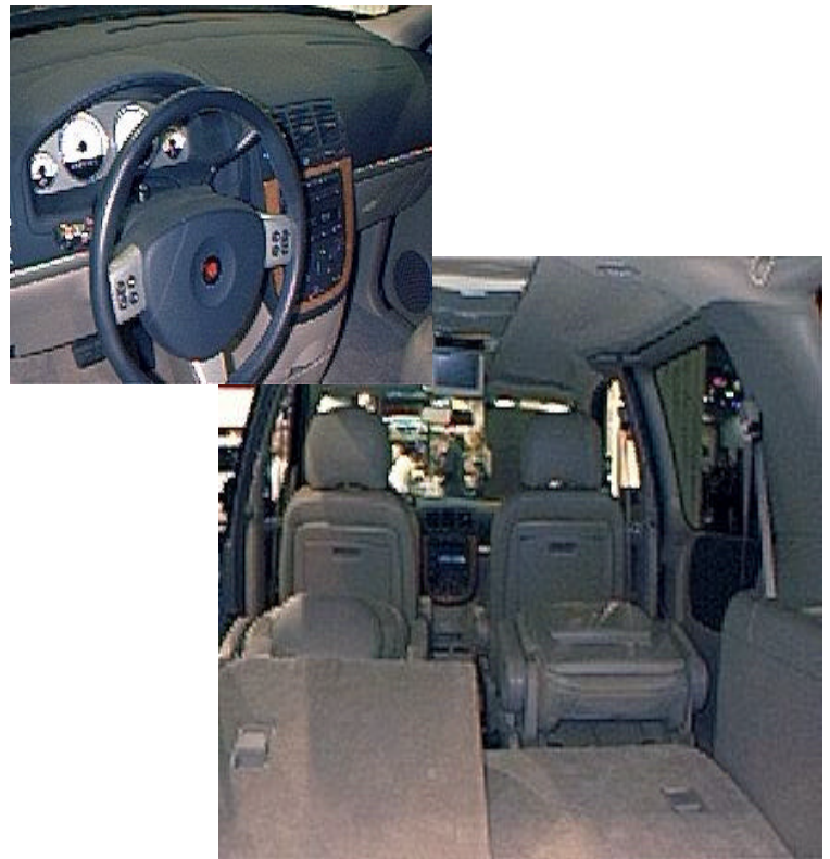
Photos of the Relay.

The hike will start at 10:00 a.m. at the Ash Cave parking lot. Plan to meet us there or travel in a group by meeting