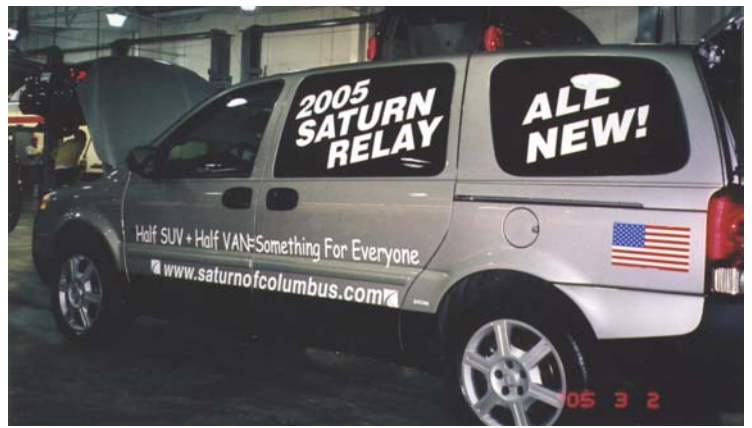
After a brief presentation about care of their new vehicles, the owners got a closer look at the vehicles in the service area.