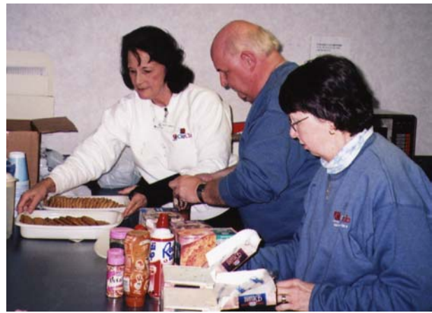
Above, a picture from the March meeting of the CarClub, which was capped off with an ice cream social.