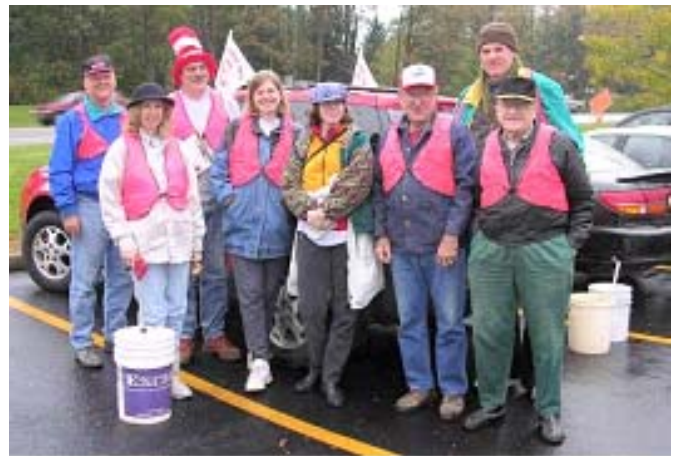
The picture above shows the Adopt-A-Highway cleaners in October 2003 getting ready to "hit the road."

We will have a signup list at the meeting for the volunteers for our first cleanup. The reason we like to have people signup in advance is that if the weather is not suitable to cleanup on Saturday, we will call everyone that has signed up to let them know that we are going to the rain date. If you don't sign up, you can still participate just by showing up. You just will not be notified if the date changes.