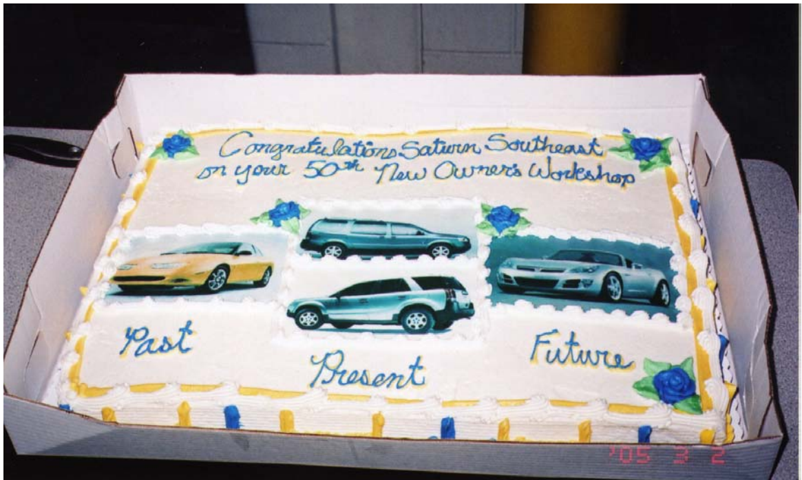
The special treat was a sheet cake to celebrate Saturn Southeast's 50th New Owners Workshop, decorated with pictures of Saturn vehicles past, present, and future.