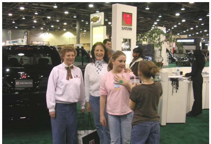
Saturn of Columbus offered CarClub members tickets to visit the Columbus Auto Show in March as well!