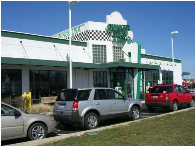
CarClub members met at Quaker Steak and Lube for lunch on March 19.