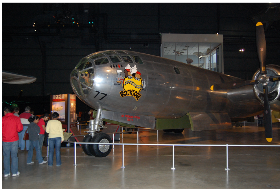
B-29 'Bockscar' dropped the second atomic bomb in August of 1945 and ended the war with Japan