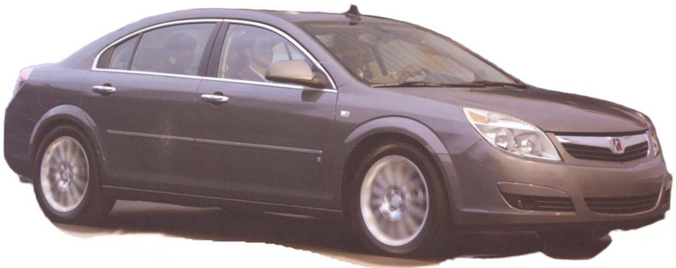
The 2007 Saturn Aura Sports Sedan: Arriving Early August.

Saturn Day at the Zoo will be September 10. Watch for an announcement in the mail. They hope to have the Aura there, and maybe the green line Vue.