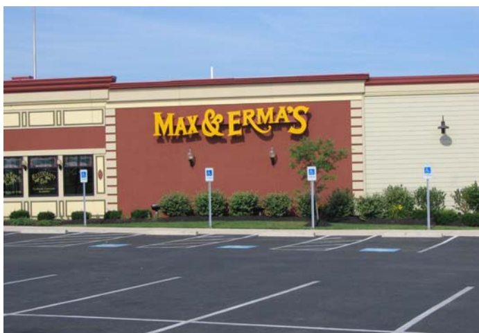
This is Max & Erma's early on a Saturday morning, before CarClub members arrive for Adopt-A-Highway.

Our trip to the Piatt Castles was very interesting. It's another one of those locations that you always hear about in travel articles and think "someday I'll go there" and for whatever reason, someday never comes. Well for a few of us, someday did come, and it was worth the trip! The houses were lovely, the grounds were gorgeous, and we had a lot of fun on the self-guided tours. We were also joined by a gentleman visiting from China as part of a library exchange program. It was very interesting to listen to his thoughts on some of the things we saw. When we were done, we decided to go eat and wound up at a restaurant called " Woody's " just outside of Dublin. The bar-b-cue was excellent, the desserts delicious, and we highly recommend the restaurant to anyone who happens to be out that way.