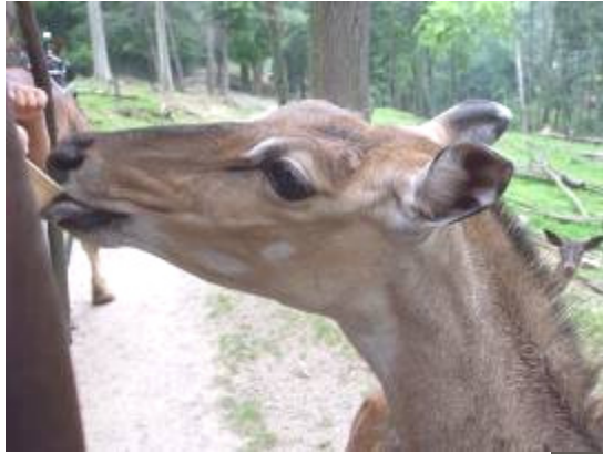
Feeding the Animals