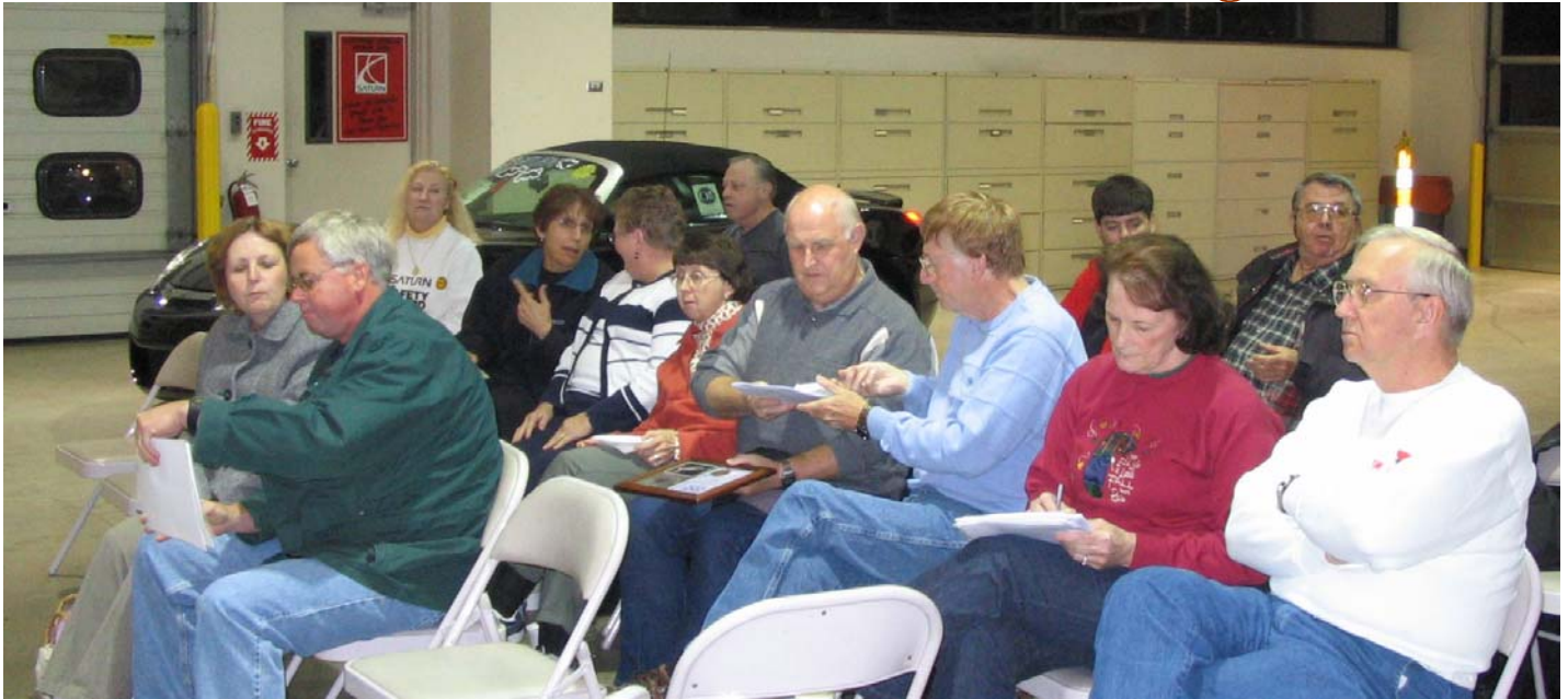
CarClub members discussed the list of zoo animals before making their choices for adoption for the year 2008.