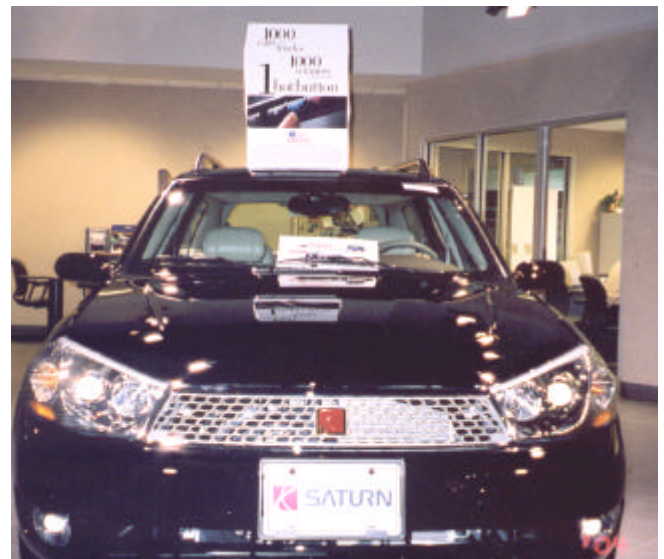
OnStar promotion vehicle, L300 with gold trim.

Before and after the January CarClub meeting, several members took a shot at winning a new Saturn as part of the GM OnStar promotion. GM has put 1000 cars and trucks in the promotion. The pictures below show the L300 at Saturn Southeast that was On-Star equipped. Judging by the lack of whoops and hollers after hearing the OnStar "operator" announce the results, no CarClub member won that day.