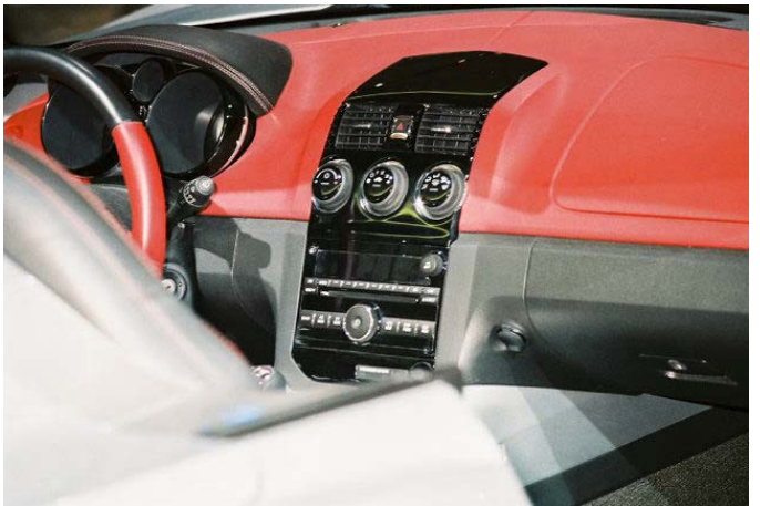
All photographs by Lowell Lutman from the North American Auto Show 2005.