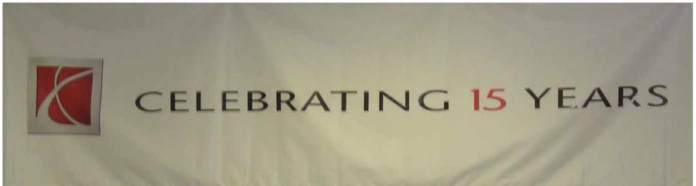
This large banner was featured prominently in the meeting room at Saturn West.