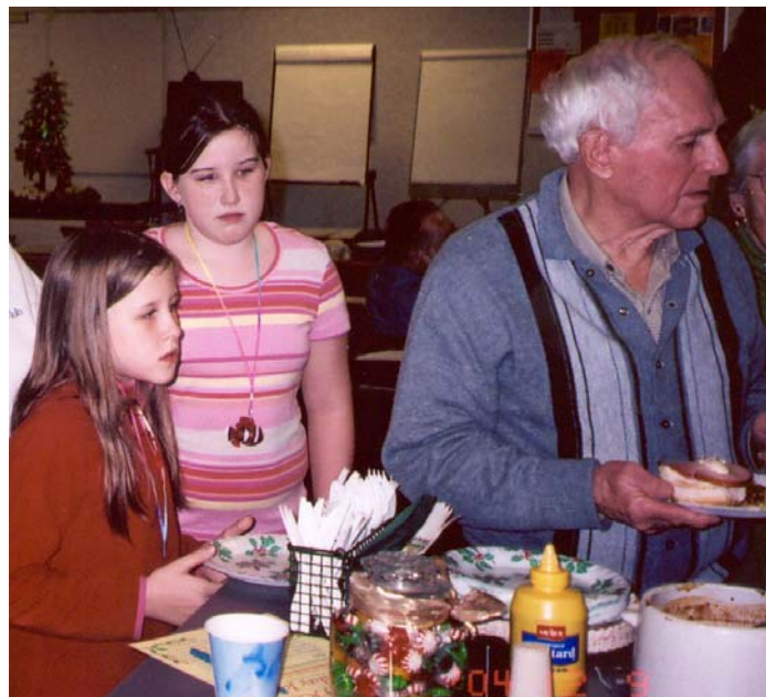
CarClub members brought several food dishes and sweets for the holiday potluck.