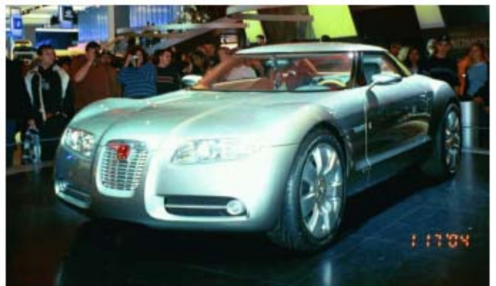
The Curve from the 2004 show.

The hotel carries a AAA three diamond rating and offers a complimentary continental breakfast with waffle bar. We have negotiated a rate of $67.99. That saves us $12.00 over their normal rate. You need to call 800-531-5900 and use the confirmation number 739 450 61 by January 5th to get the special rate. We are sorry for the short notice and in the future will make sure that there is more time to plan for the events.