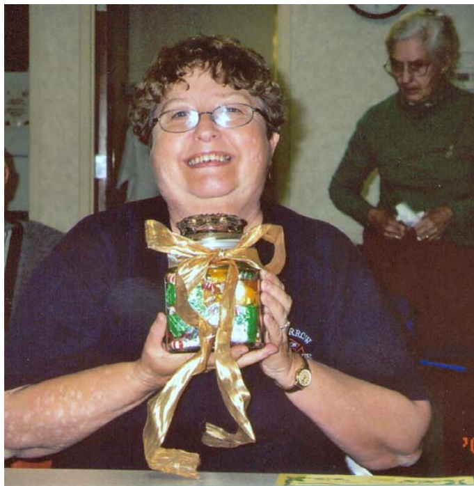
This happy CarClub member knew exactly how much candy was in the jar.