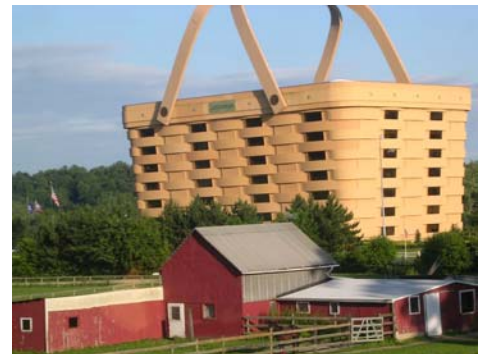
Not trick photography — this is the home of the Longaberger Basket Company.

The Big Buckeye Birthday Bash in Dennison was held around the historic Dennison Depot, which was built in 1873 and is listed on the National Register of Historic Places. The Depot was restored and reopened in 1989 in memory of the many railroad employees, travelers, and servicemen and women who passed through its doors. The depot is most famous for its role during World War II, when the railroad played a vital role in the movement of troops. The Salvation Army Servicemen’s Canteen operated 24 hours a