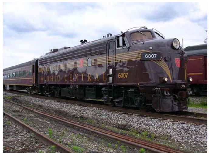
The Ohio Central engine, which powered the Ohio Bicentennial Train to Dennison and back.

The real highlight for the month was the Bicentennial Train ride . See the article on page 4 for more details.