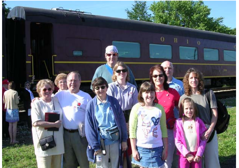
CarClub members and their families ready for a train ride.

The CarClub highlight for the month of June was the Ohio Bicentennial Train Ride to Dennison Ohio on June 21st. Eleven CarClub members and five family members boarded the train in Newark and departed at 9:30 a.m. for a three-hour ride to the “Big Buckeye Birthday Bash.” Some of the CarClub members and families stopped long enough to get the picture at right just before boarding the train in Newark.