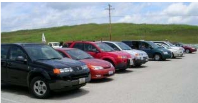
The lineup of Columbus Saturns in the Visitor's Center parking lot at the Spring Hill facility.