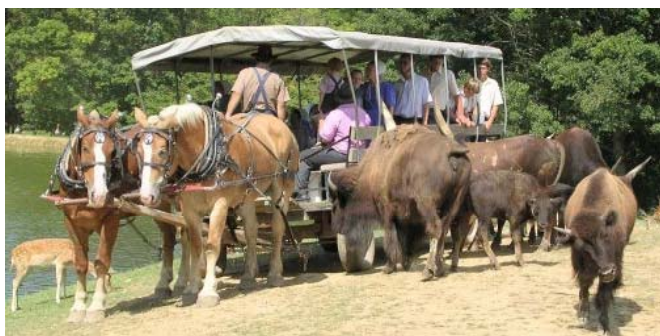
A farm wagon takes CarClub members around the Rolling Ridge Ranch.

We will be riding a wagon (like the one pictured below) out over 80 acres of woods and pasture. The cost of the wagon ride is $12.50/person. If 15 join the group, the cost will be $5.50/person. For senior citizens and kids ages 3-12, the cost is $7.50.