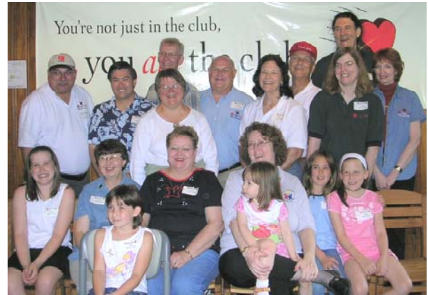
The Spring Hill plant is a very special place for CarClub members and their families.

The tour through the Saturn plant took place at 10:00 a.m. on Tuesday June 22nd. Twelve CarClub members were joined by five family members and several "special guests" for the tour.