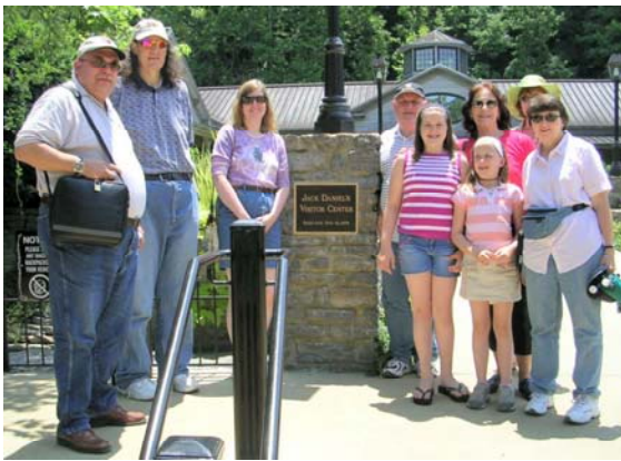
Some of the group in front of the entrance pillar to Jack Daniels.

The kids made good use of the pool and everyone met over breakfast, provided by the Baymont Inn, to make plans for the day's activities. The traditional trek to tour Jack Daniels was held on Monday. Other members went to the Children's Science Museum or to the Norman Rockwell sculpture exhibit. All activities were considered well worth while by those attending them.