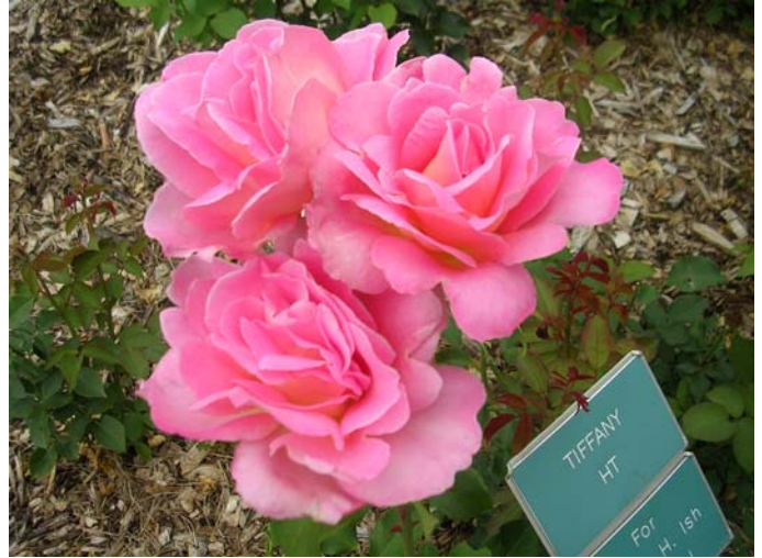
Photo of a beautiful hybrid tea rose at the Park of Roses at the Rose Festival. More than 11,000 rose bushes are tended on the 13-acre site, one of the largest municipal gardens of its type in the United States.