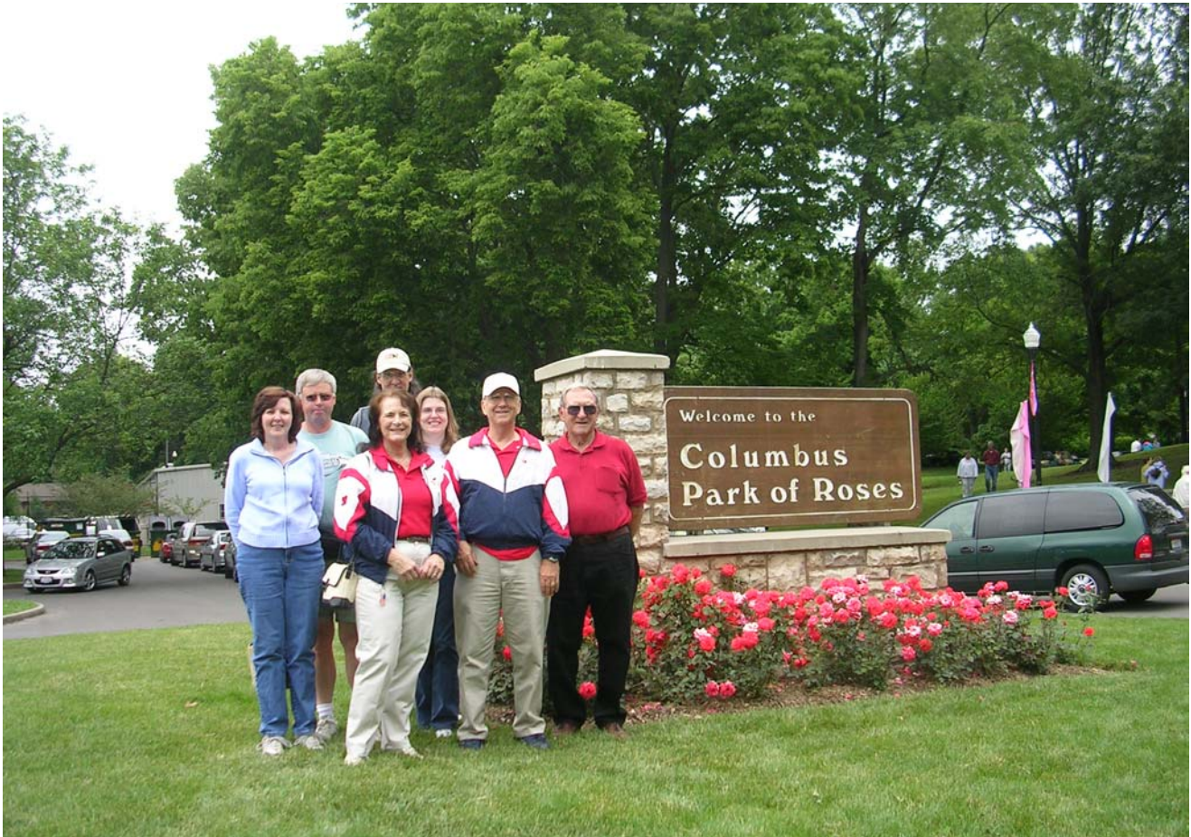
CarClub members pose for a picture before attending the Rose Festival.