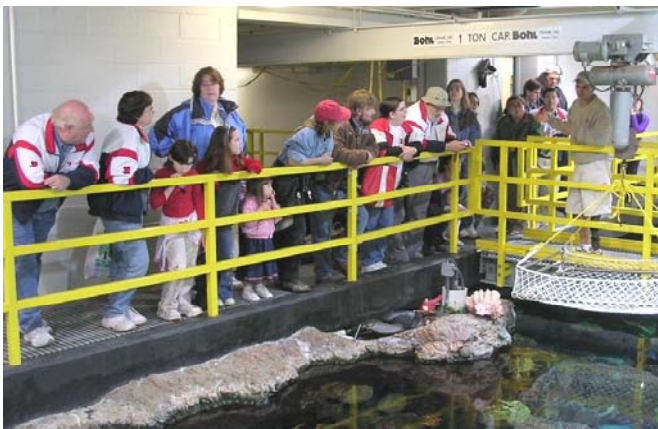
A view of the CarClub members listening to the guide and looking into the top of the aquarium.