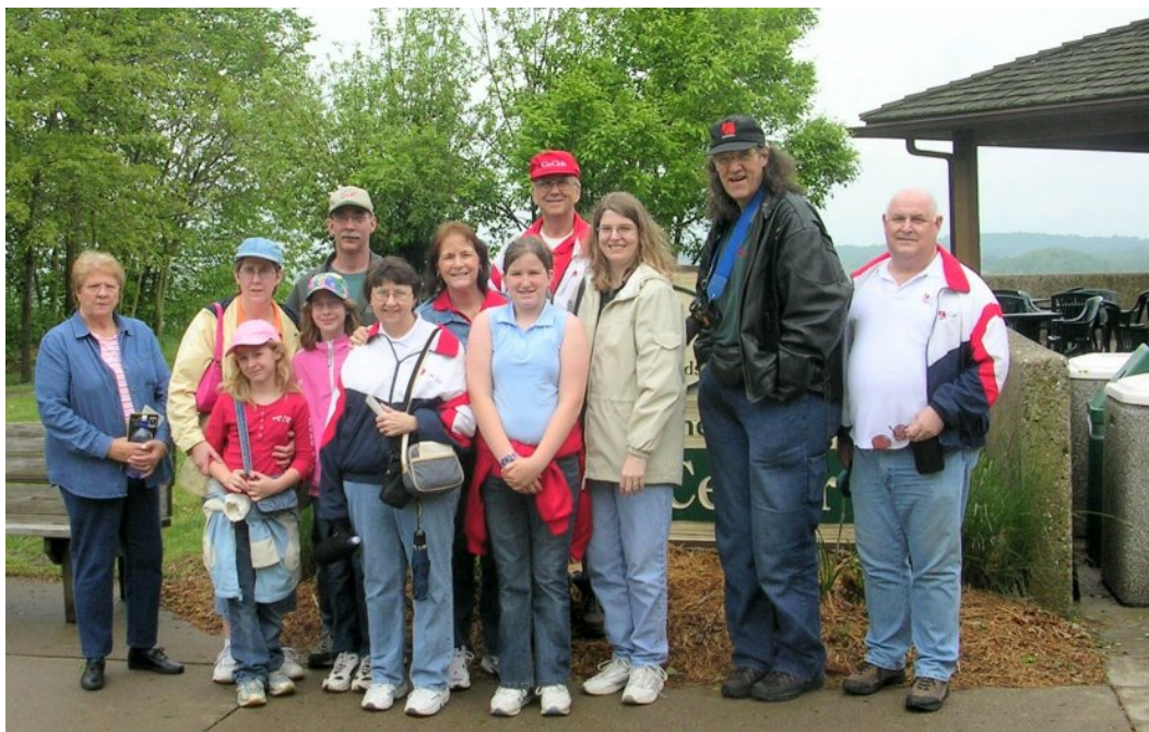
The weather was cooperative when CarClub members visited the Wilds in May. More pictures inside!