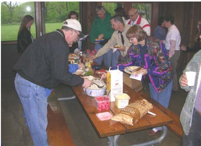
The meeting/picnic at Highbanks Metro Park had a good turnout, with good food and a lot of fun. The CarClub paid for the meats and rolls. The remaining food was done up in true pot luck fashion. Members were very happy to have use of the enclosed shelter, as it was a very wet, and not just from the Olentangy River. As nice as everything is at Highbanks, there's no point in looking there; you would probably do better along the banks of the Scioto River.