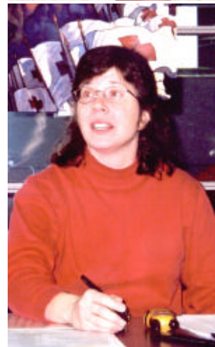
A couple of the people who helped on Donor Day.

I would like to welcome the new members: