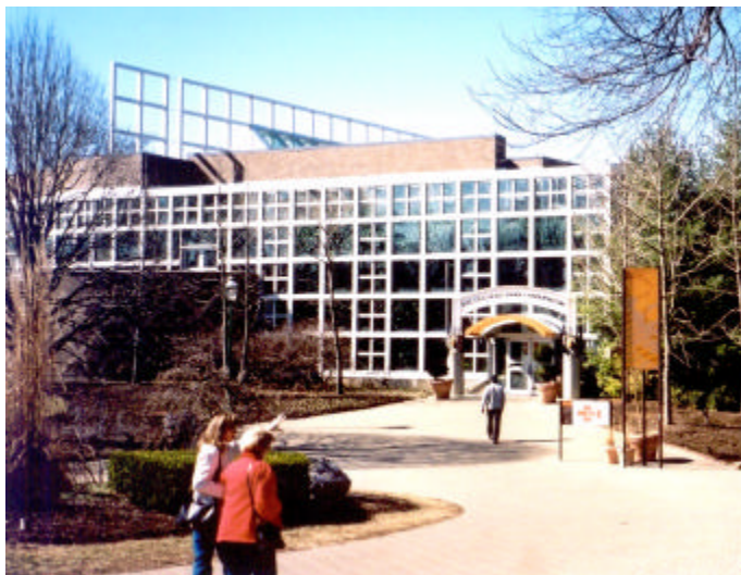
The Franklin Park Conservatory, our March destination.