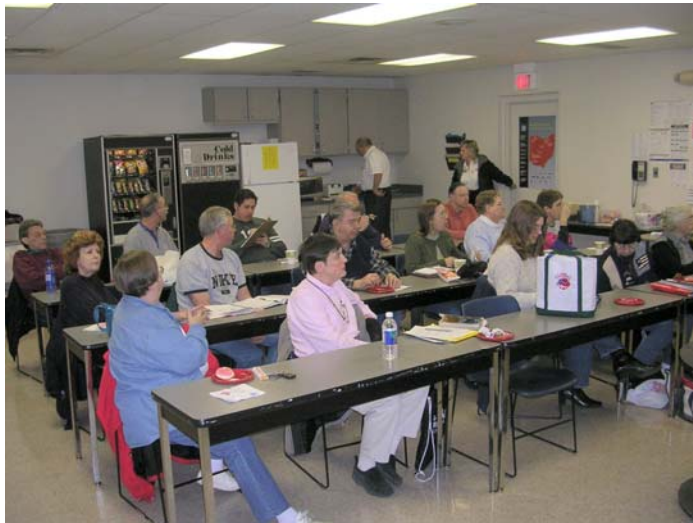
At the February meeting, members heard about the recent trip to the Detroit Auto Show.

Saturn has offered to have some activities for us if we come to Detroit , and some of our members who visited the auto show back in January found many interesting locations to visit. We discussed this change at the February meeting and had a very good response to the suggested change. We will have another discussion at the March meeting; if there are no major objections, we can start making plans for a trip to Detroit this summer. Let us know what you think about changing our annual trip.