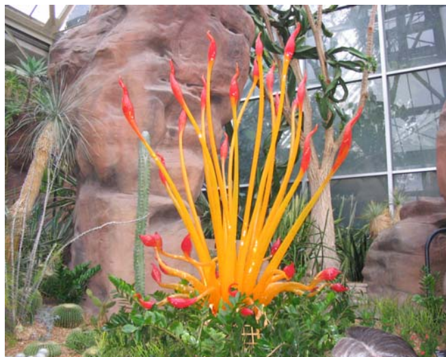
Art created by Dale Chihuly, inspired by nature, at Franklin Park Conservatory.

Don't forget Adopt-A-Highway , starting up again in April, and our late April trip to Marion to tour the Harding Home and the Popcorn Museum . And it's not too early to be making plans to join us for our trip to Detroit in August for the Woodward Dream Cruise!