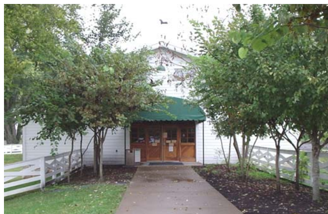
CarClub June Destination: Saturn Welcome Center.