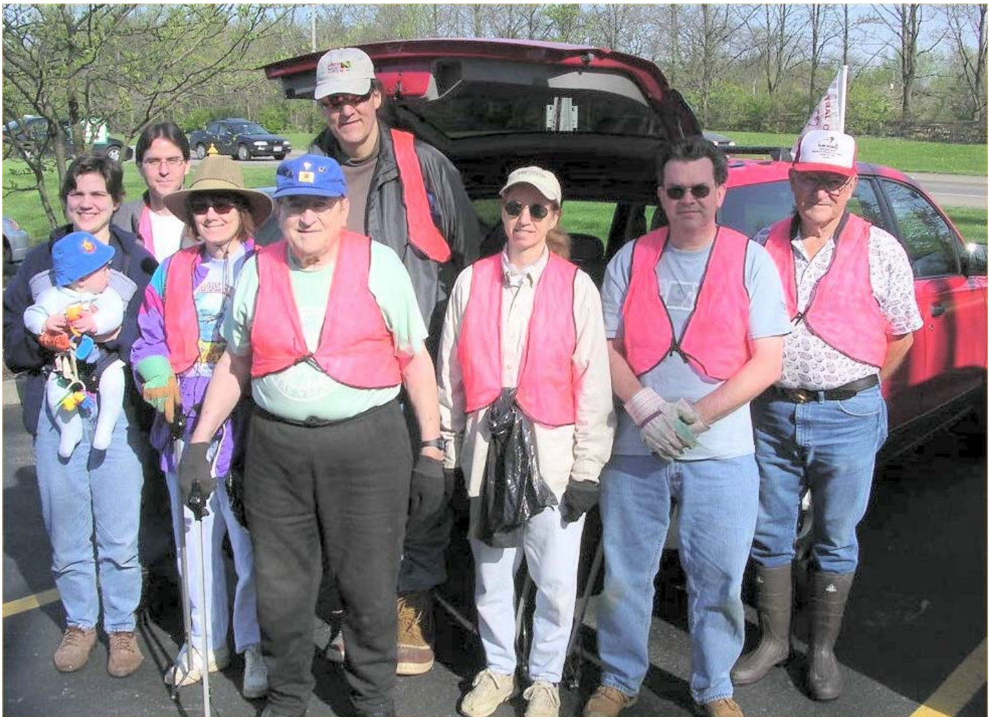
Good shoes, gloves, safety vests, bug repellent, sunscreen, and trashbags were the order of the day.