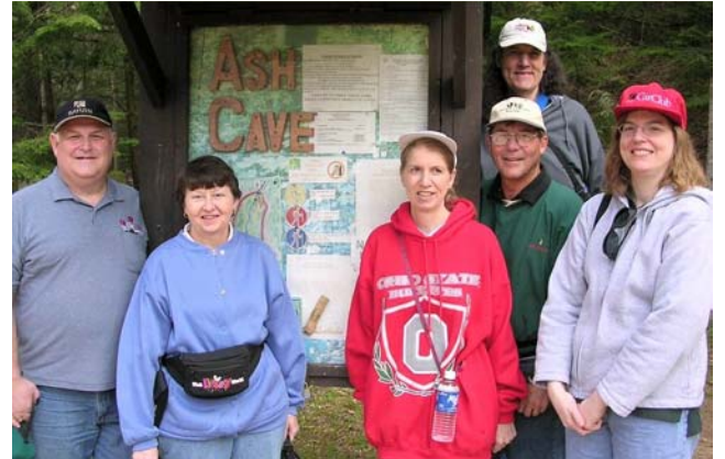
Above: The orientation session with a Park Ranger. At right, CarClub members pose for a picture at the main trail sign.