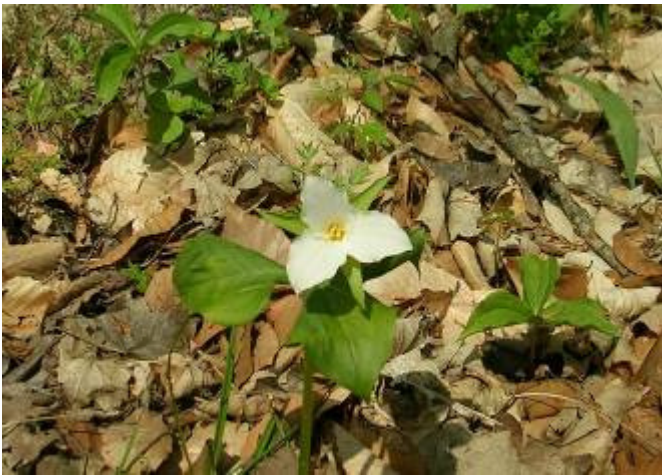
Pretty flowers! We could look and photograph but not take – that way the flowers will be there for many years and everyone can enjoy them!