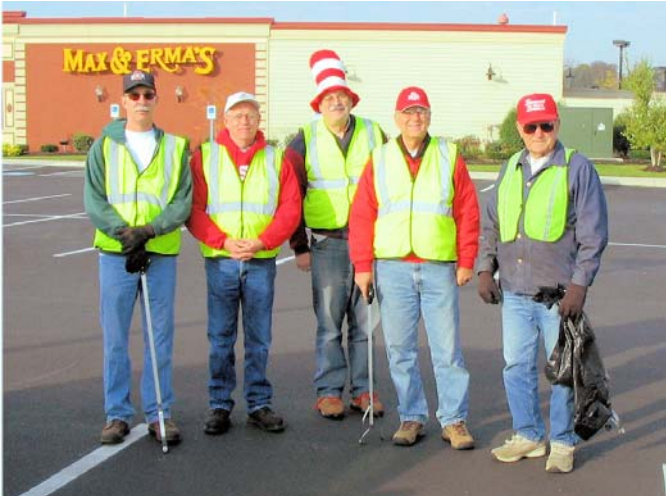
CarClub members were greeted by sunny skies for the Adopt-a-Highway community service. Becky Harrass is behind the camera.