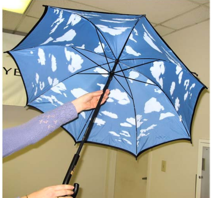
... that looks just like this one. Chances are $1.00 each. Half the proceeds will go to the charity for the quarter, LifeCare Alliance.