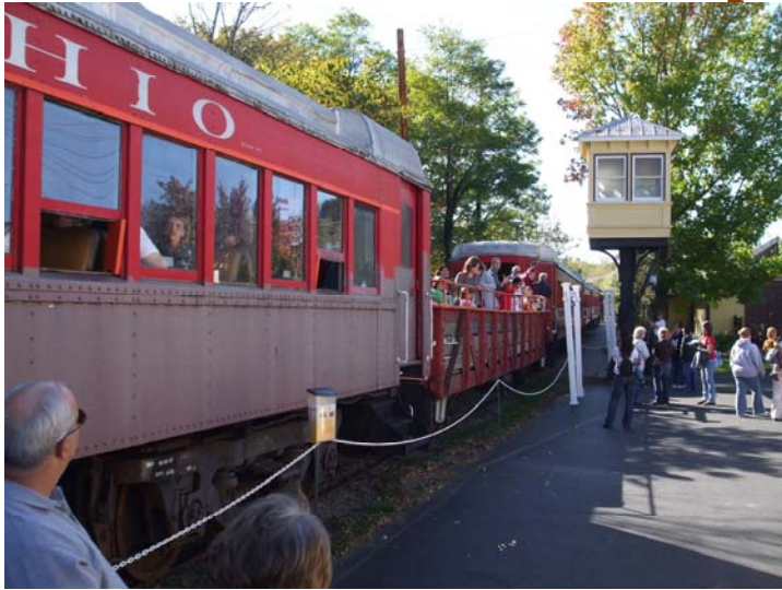
Above: View of the train. It was a gorgeous day for a ride.