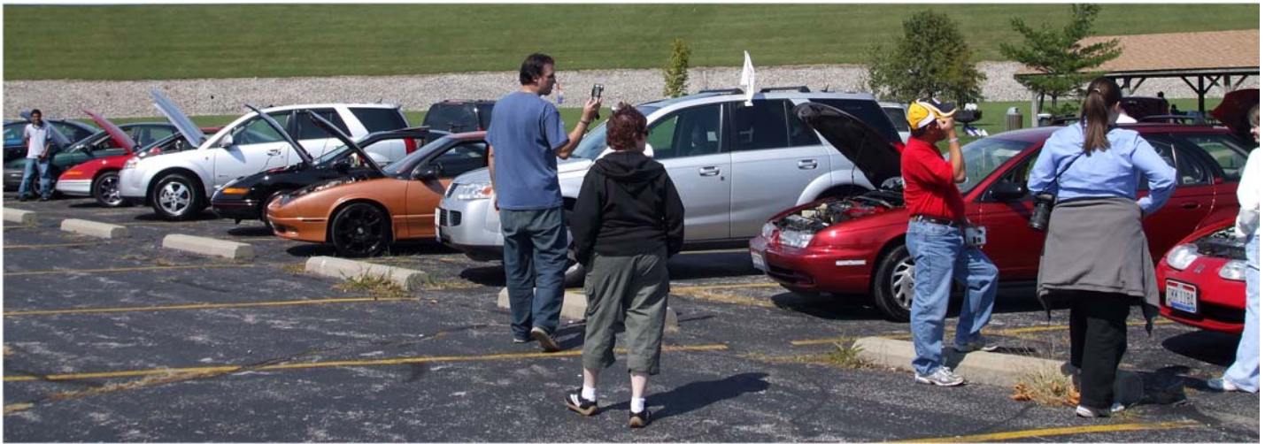
Saturn owners show what is under the hood of several Saturn models at Alum Creek State Park.