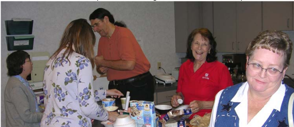
Ice cream is always a crowd pleaser at the Saturn CarClub meetings.