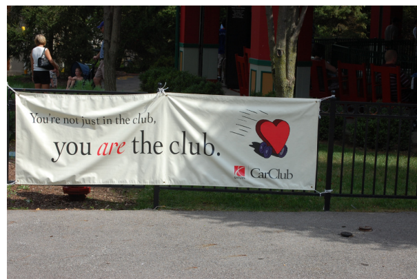
Central Ohio Saturn Car Club at the zoo