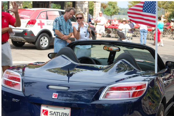
Highlight of the Show, a new SATURN SKY