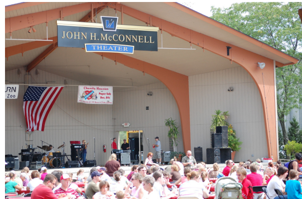
A large crowd enjoying a free lunch