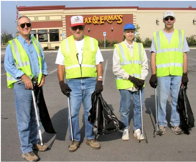
Members show proper attire, protective gear, and equipment prior to meeting the CarClub's obligation to clean a stretch of highway out East Broad Street. Their dedication has helped the CarClub attain and maintain Gold Star status. The last Adopt-A-Highway service of the year is scheduled for October 15, but if the weather turns really nasty, it will be rescheduled.