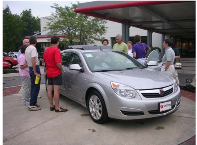
CarClub members took an opportunity to check out the Aura as part of the mini-event at the August meeting at Saturn North. The dashboard is shown below — see those keys in the ignition! The center brake light is less disruptive at the bottom of the rear window, don't you think?