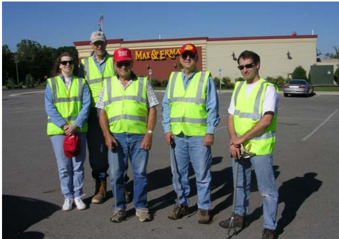
CarClub members in safety vests and sensible shoes, ready for the Adopt-a-Highway activity.