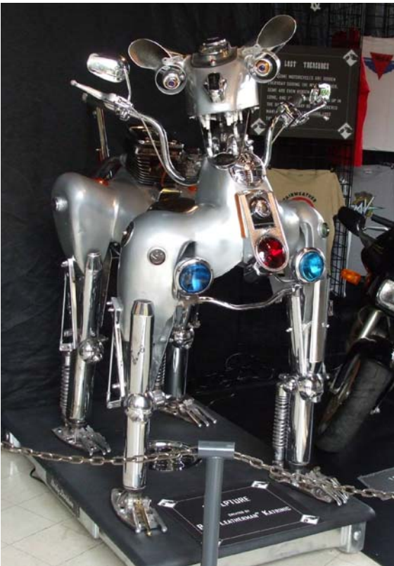
Al Clapsaddle's New Bike????