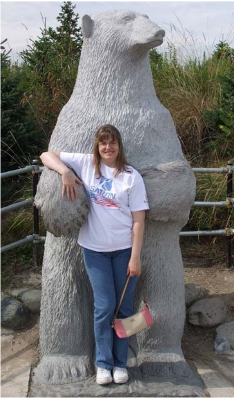
Our President with the newest recruit for her security team.